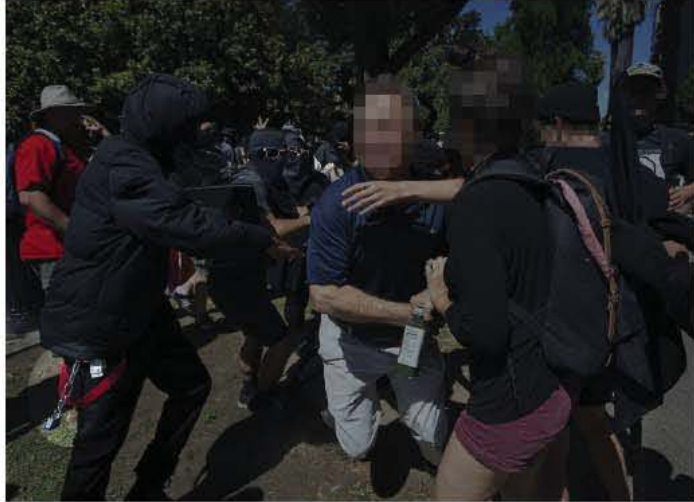
(U) Anarchist extremists dressed in “black bloc” attire attempt to intimidate a cameraman to stop him from filming at the Sacramento rally. Note the individual on the left has a makeshift weapon known as “smiley”—a chain with a lock on its end—hanging from his waist, ostensibly for use in attacks against white supremacists. 28 A video of the events is also available. 29