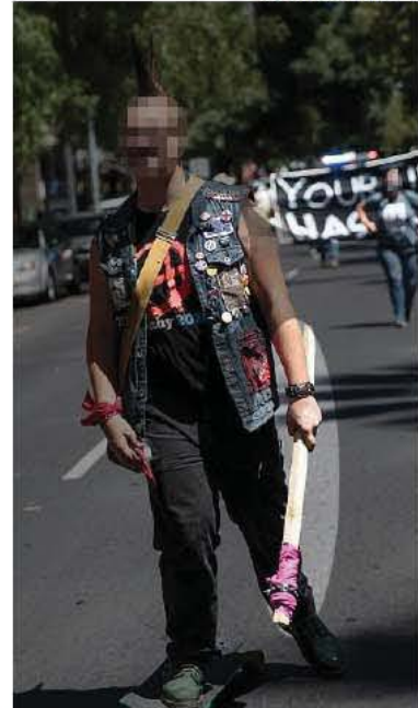
(U) A suspected anarchist extremist carries a homemade club for use in attacks on legally protesting white supremacists at the 2016 Sacramento rally. 23