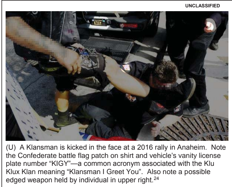
(U) A Klansman is kicked in the face at a 2016 rally in Anaheim. Note the Confederate battle flag patch on shirt and vehicle's vanity license plate number “KIGY”—a common acronym associated with the Klu Klux Klan meaning “Klansman I Greet You”. Also note a possible edged weapon held by individual in upper right. 24