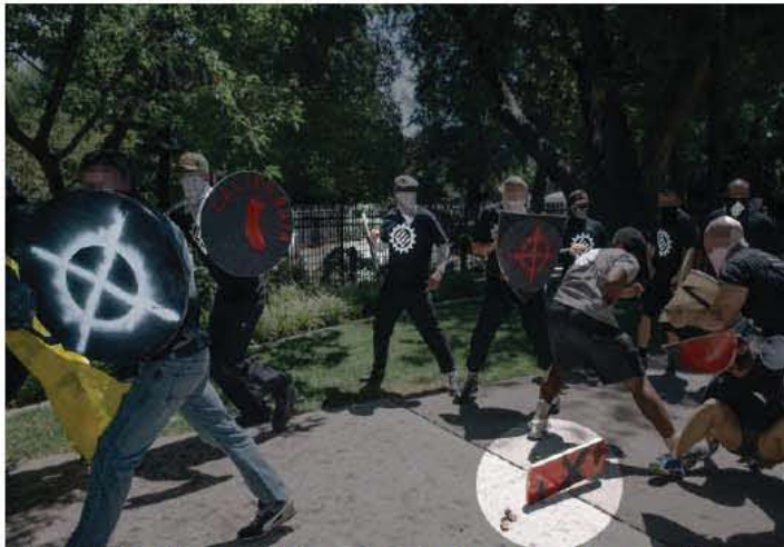
(U) Anti-fascist anarchist extremists attack legally protesting white supremacists at a 2016 rally in Sacramento using makeshift weapons such as a skateboard on ground at lower right. Note the Celtic Cross symbol in white and red on left and right shields, a symbol of an identified USPER racist skinhead group in red on center shield, and a symbol of an identified USPER white supremacist movement in white on T-shirts. 22