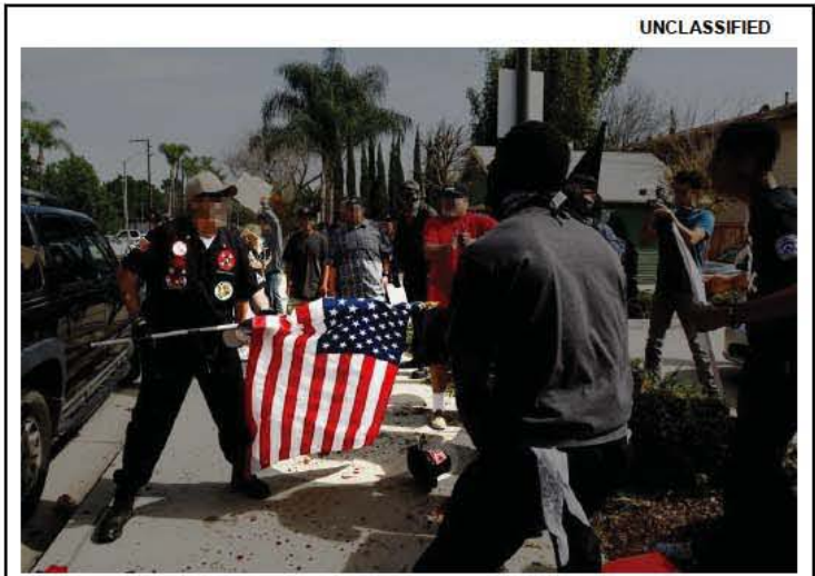
(U) A Klansman stabs at violent anti-fascists and anarchist extremists with the decorative end of a flag pole, resulting in injuries at the Anaheim event. Note the Klan patches on his shirt and blood spatter on the ground. 19